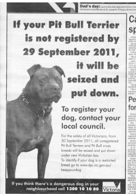
Figure 4: A poster shows that if your Pit bull is not registered by a certain date, than it will be removed from your care and put down.

bull; however, the officer believed him to be a Pit bull. It all came down to whether the veterinarian would claim him as a bulldog or Pit bull. If the dog was deemed as a bulldog then the owner would be able to keep, but if he was labeled as a Pit bull then he would have to be rehomed (Wisely, 2016).